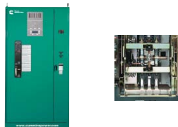
BTPC transfer switch, with open, closed or programmed transition (left); enlarged detail of internal switch mechanism (right).

The appropriate setting for the delay time depends upon the MRI manufacturer’s recommendation. The MRI equipment manufacturer calculates the time delay from the RC time constant of the filter capacitor. Programmed transition transfer switches have adjustable time delays ranging from 0 to 120 seconds. These adjustable delays are standard on bypass isolation transfer switches, which are often used for critical and life safety circuits in health care facilities.