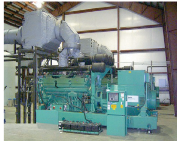
Figure 4. SCR units (insulated in gray) can take up a considerable amount of space.

In addition, some aftertreatment devices can add a significant amount of backpressure, requiring precise, duty-cycle-based control of temperatures and dosing frequency for regeneration. Such devices also represent an additional item to be serviced. Finally, most NOx aftertreatment devices reduce emissions when operating at high temperatures, but such temperatures may not even be reached by an emergency standby generator that is lightly loaded.